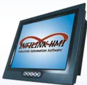
RuggedPC-15T 15" Sunlight Readable Industrial Panel PC

The Rugged PC Series is an industrial panel PC which combines our display technology with an Intel high performance CPU. The front is waterproof (IP65/ NEMA4) and features a high brightness display and special aluminum alloy casing. The Rugged PC Series is a cost effective PC and Display solution from the leaders in Outdoor Displays.