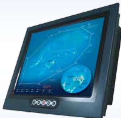
RuggedPC-17T 17" Sunlight Readable Industrial Panel PC