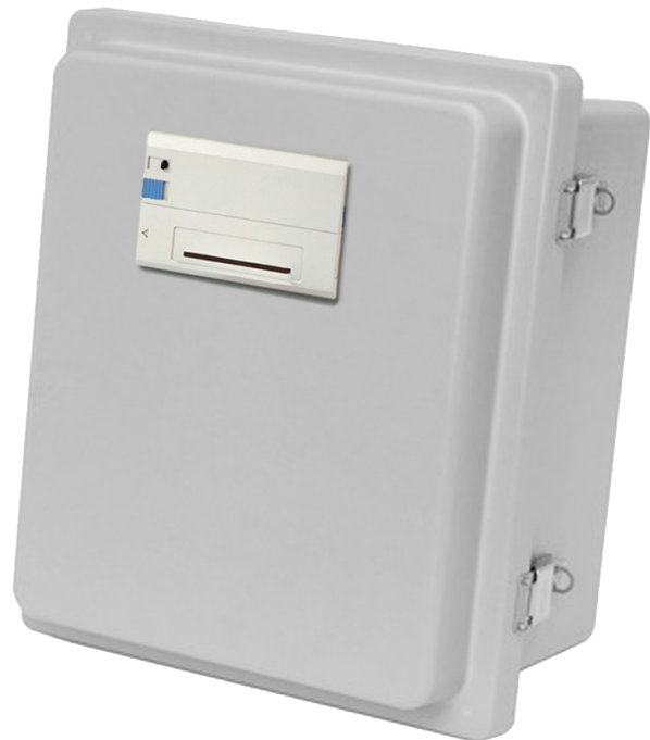
-N Option, Nema 4X Enclosure