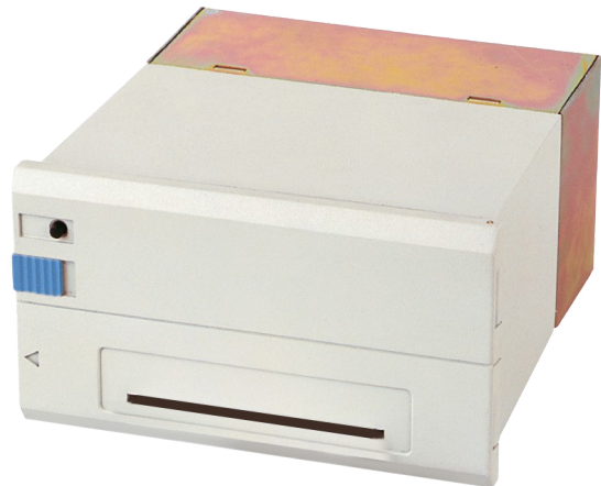
Standard Panel Mount