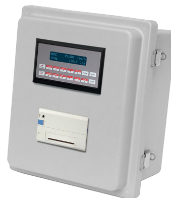
Custom Configurations Available